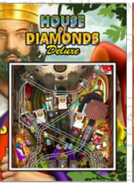
House of Diamonds Delukeool Champion Deluke Red Show Deluxe