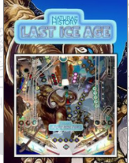
The Last Ice Age