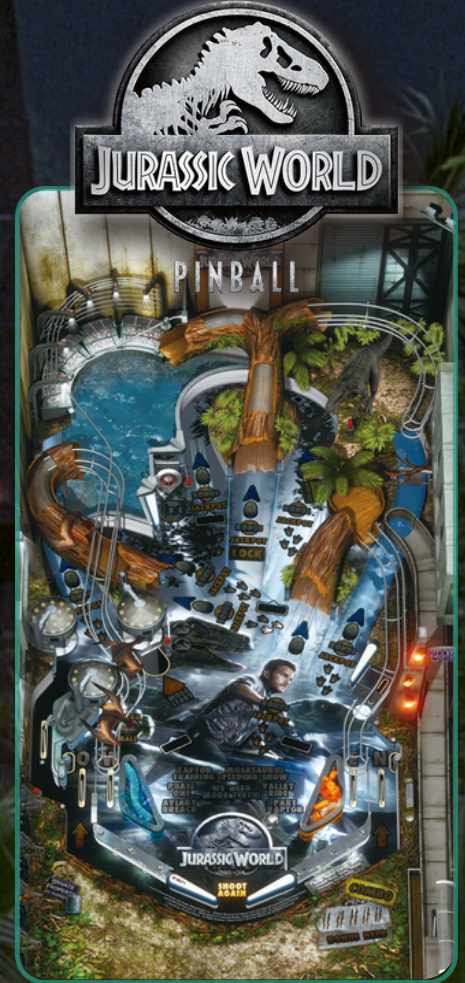
Jurassic World Pinball

EXPAND YOUR LEGENDS PINBALL 4KP WITH HUNDREDS MORE ADDITIONAL LEGENDS 4K™ PINBALL TABLES!