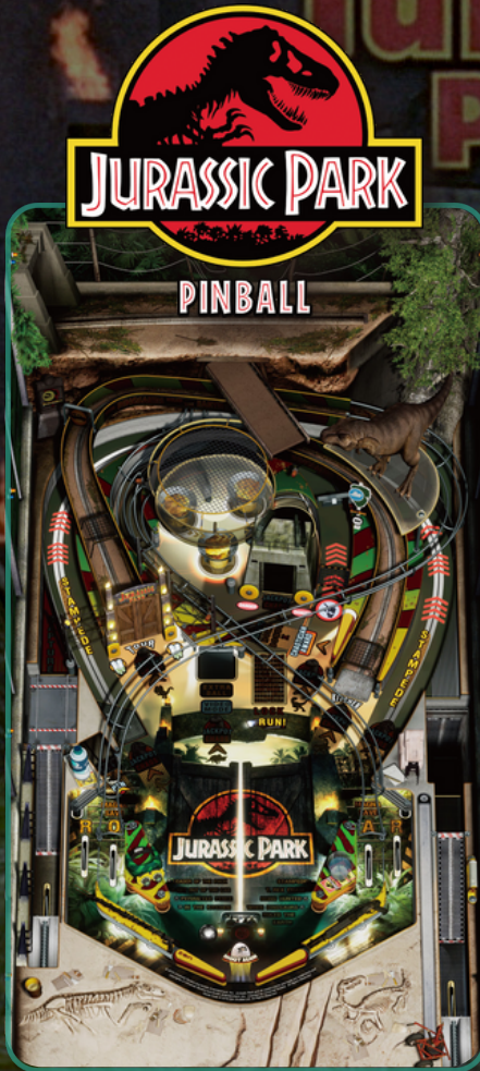
Jurassic Park Pinball